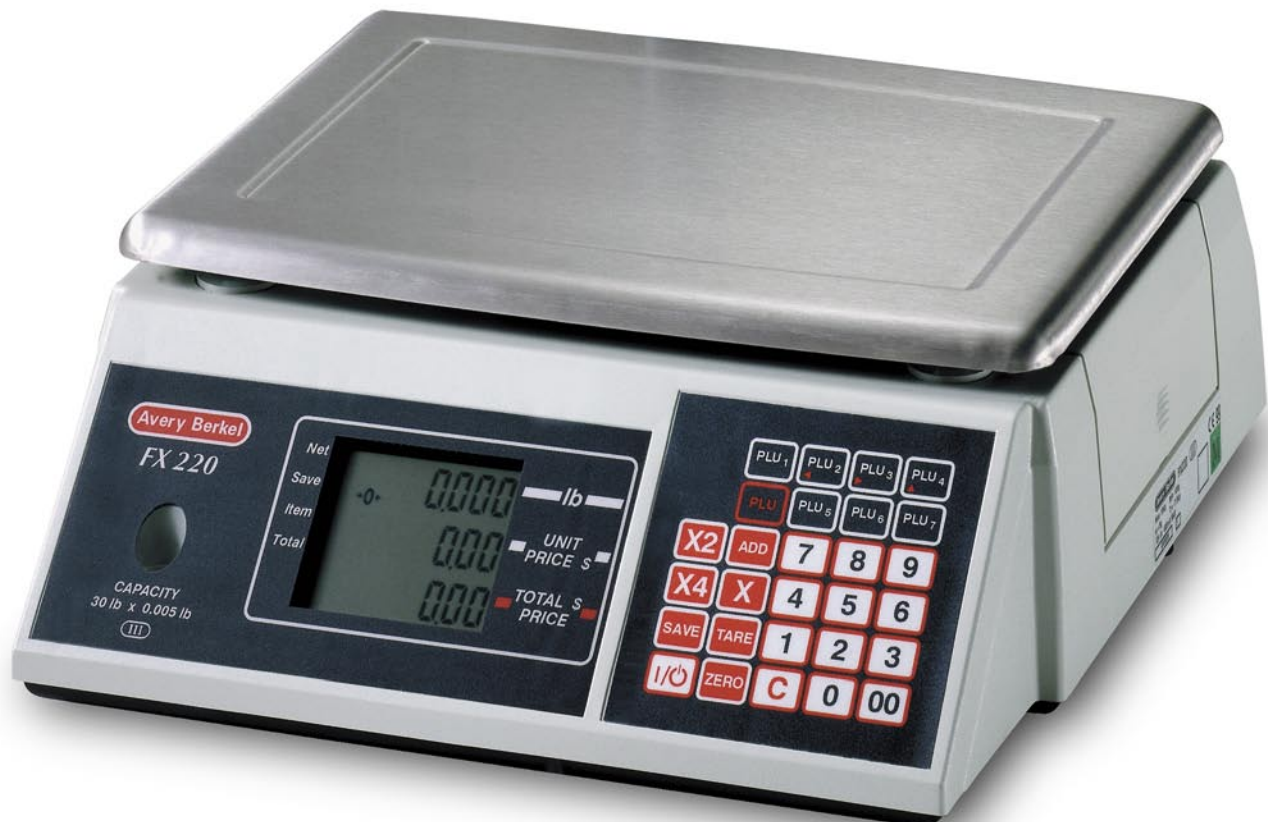
left: optional customer tower