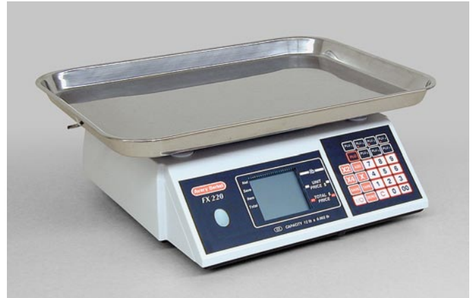
above: optional produce/fish tray