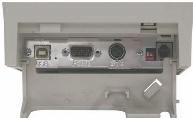
RS232 Serial/USB Interface Shown Above