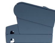
Power supply case fits under printer without increasing footprint size.