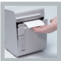
Close the door. The paper is fed automatically.