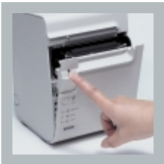
Pull the lever, and open the door until it is fully open.