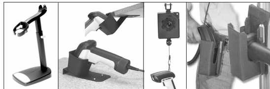
Accessory mounts also available