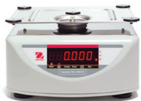
Rear view of dual display "T" models