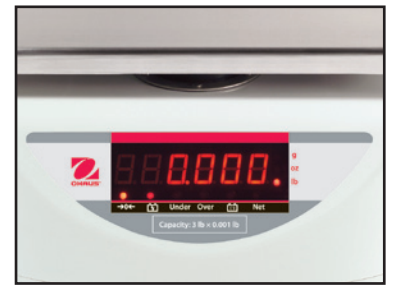
Dual display "T" models have a second display on the rear of the scale