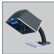
Flex-pole stand MLPN 46-00868