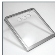
Protective window MLPN 46-00867

For more information: www.honeywell.com/aidc