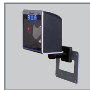
Wall-mount stand MLPN 46-00869