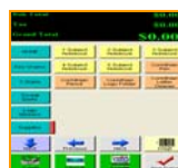
Touch Screen Lookup