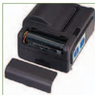
Long battery life using Li-ion battery