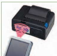
Wireless communication using IrDA