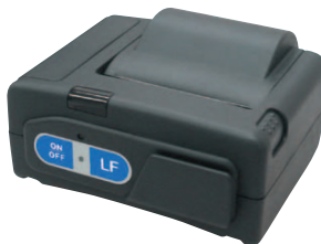
Mag stripe card reader version