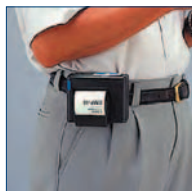
Belt clip available as standard